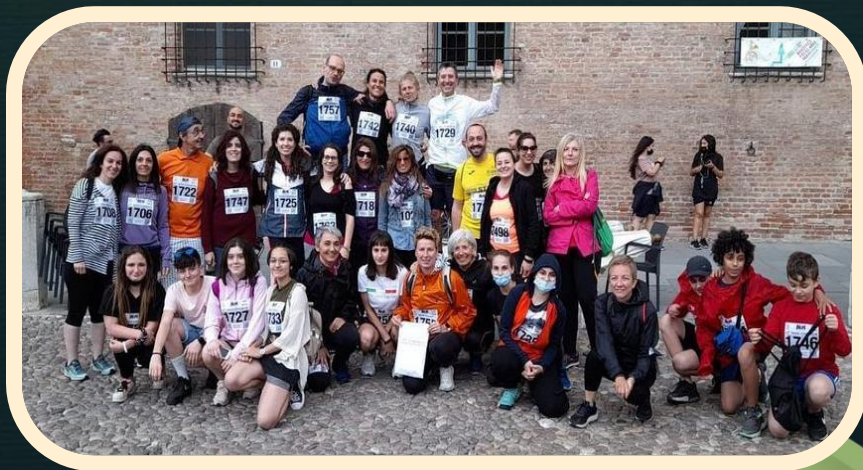
Students and Teachers of our Institute who joined the event