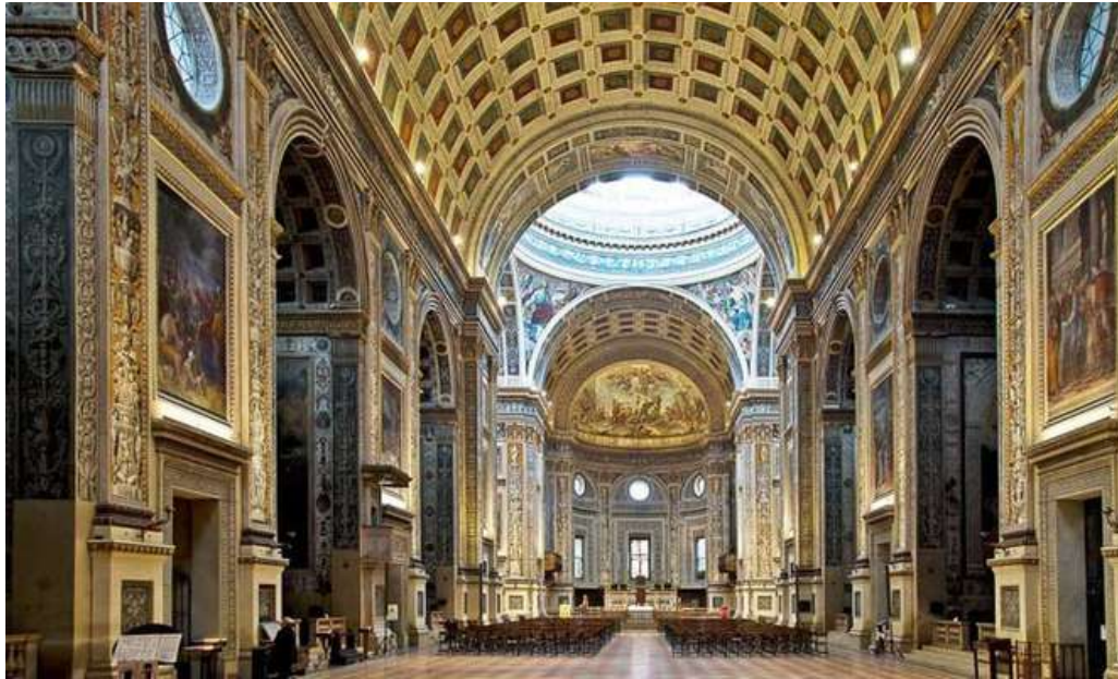
Basilica di Sant'Andrea

Although it is not the city's cathedral, this church is the largest and among the most popular; the great Leon Battista Alberti designed it and the frescoes were created by important painters such as Mantegna, Canova and Giulio Romano. The church contains the relic of the Precious Blood of Christ.