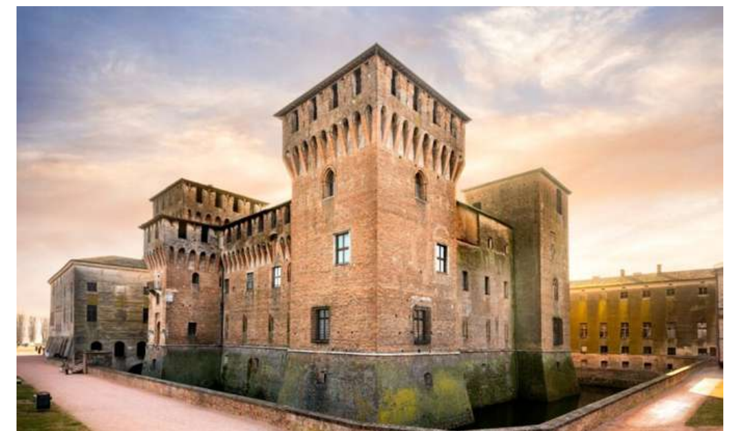
Castello di San Giorgio

The castle of San Giorgio was built in 1395 by the Gonzaga family - as soon as they took possession of the city - with the purpose of both defense and a display of economic and political power. The castle, very similar to that of Ferrara, was projected by Luca Fancelli and enriched with important frescoes like the “Bridal room”.